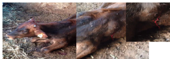
Figure 2. Prolonged bleeding time following injection in case 2

Arterial blood gas analysis and selected coagulation parameters were analyzed. ELISA test kit (IDEXX SNAP® BVDV AntigenTest, United States) and PCR (Veterinary Research Control Institute, Bornova, İzmir) performed in diagnostic procedures of probable BNP to excluding from BVD in first calf.